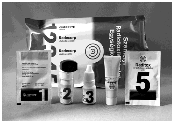
Picture 2. Personal Radiotoxicological (First Aid) kits health (medicament) products