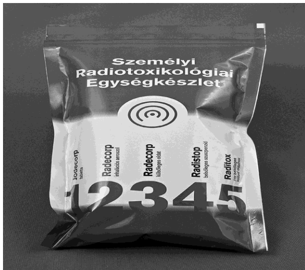
Picture 1. Personal Radiotoxicological (First Aid) kit external form

The body of the Personal Radiotoxicological (First Aid) Kit and the pharmaceutical inventory (medication set) of 1–4. shown in Pictures.