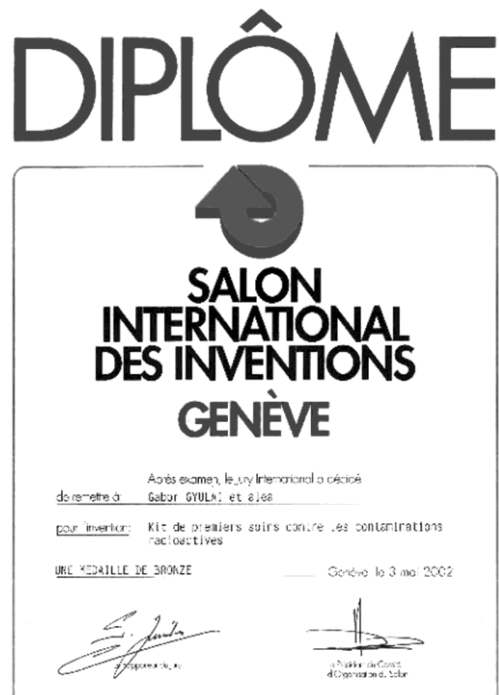
Picture 5. Geneva International Innovation Award