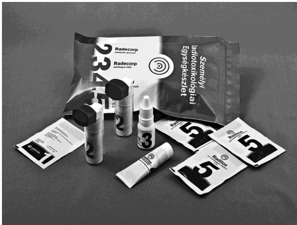
Picture 4. Personal Radiotoxicological (First Aid) kits health (medicament) products