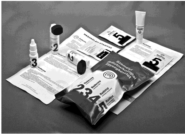
Picture 3. Personal Radiotoxicological (First Aid) kits health (medicament) products